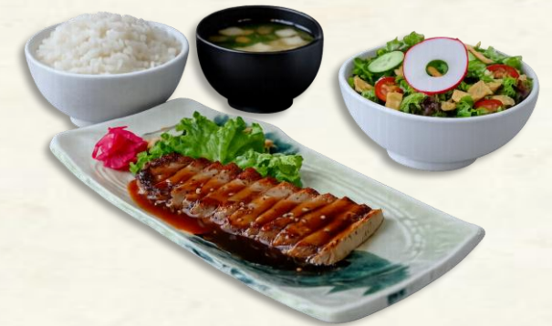
Beef Teriyaki Entrée