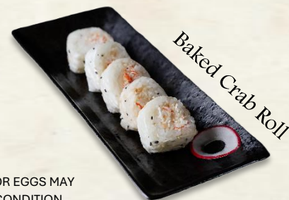
Baked Crab Roll

*CONSUMING RAW FISH OR UNDERCOOKED MEATS, POULTRY, SEAFOOD, SHELLFISH, OR EGGS MAY INCREASE YOUR RISK OF FOODBORNE ILLNESS, ESPECIALLY IF YOU HAVE A MEDICAL CONDITION