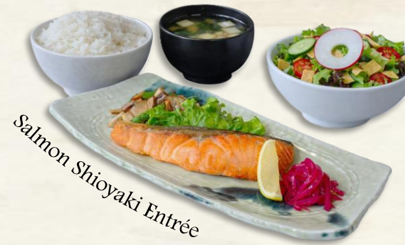
Salmon Shioyaki Entrée

Served w/ miso soup & salad (choice of Miso, Ponzu or Ginger dressing)