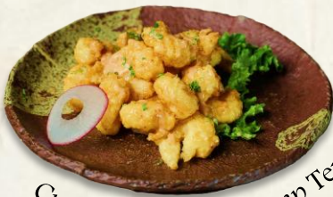
Creamy Popcorn Shrimp Tempura