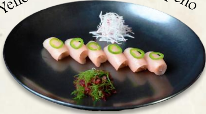
Yellowtail Sashimi w/ Jalapeño