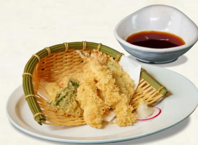
Shrimp & Vegetable Tempura