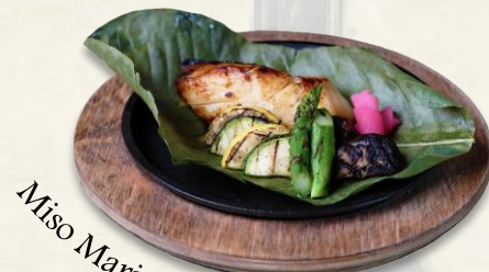
Miso Marinated Black Cod