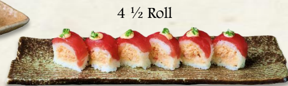
4 ½ Roll