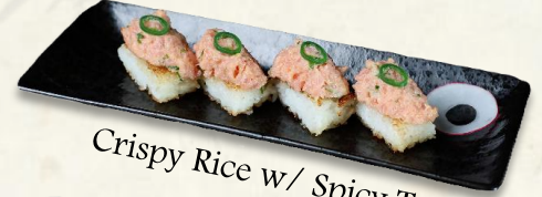
Crispy Rice w/ Spicy Tuna