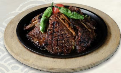
BBQ Short Rib