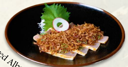
Seared Albacore w/ Crispy Onion