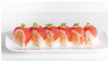
4 1/2 Roll