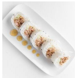
Cajun Salmon Roll