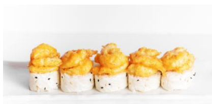
Spicy Tuna Popcorn Shrimp Roll

Soft Shell Crab, Cucumber, Avocado, Seaweed Wrapped