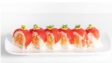
4 1/2 Roll